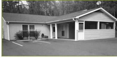
Webster Group Home, 103 Little Savannah Road, Webster